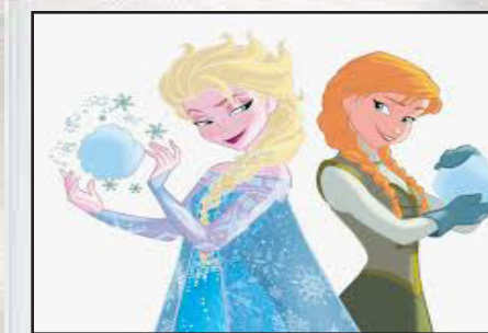
A fourth grade girl sitting under a water fountain reads a Frozen book.