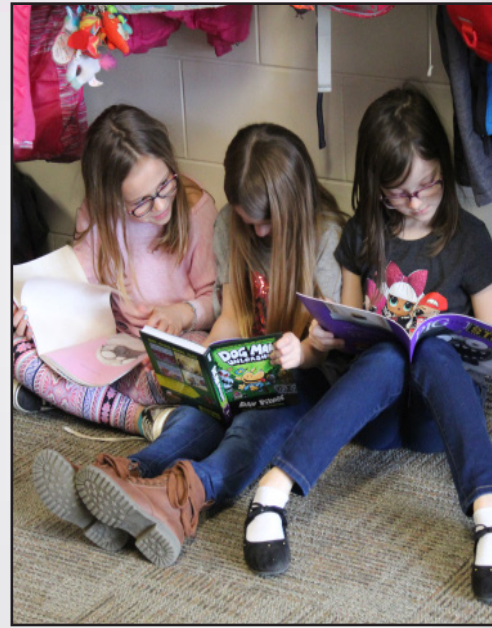
A group of second grade girls reads there books while look at each others.