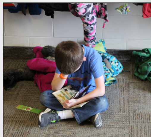
A second grade boy reads a book about Minecraft.