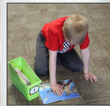
A second grader reads a book about dinasours and dragons.