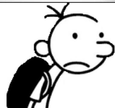
Fourth grader reads books about Diary of a Wimpy Kid.